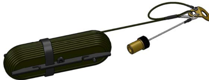
Antenna kit, as supplied

This long wire antenna kit is designed to improve efficiency of Lencom® mobile HF antennas when stationary.