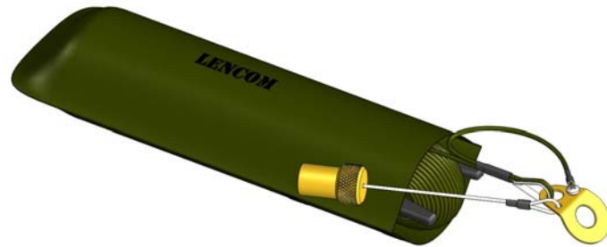
Complete assembly in the bag